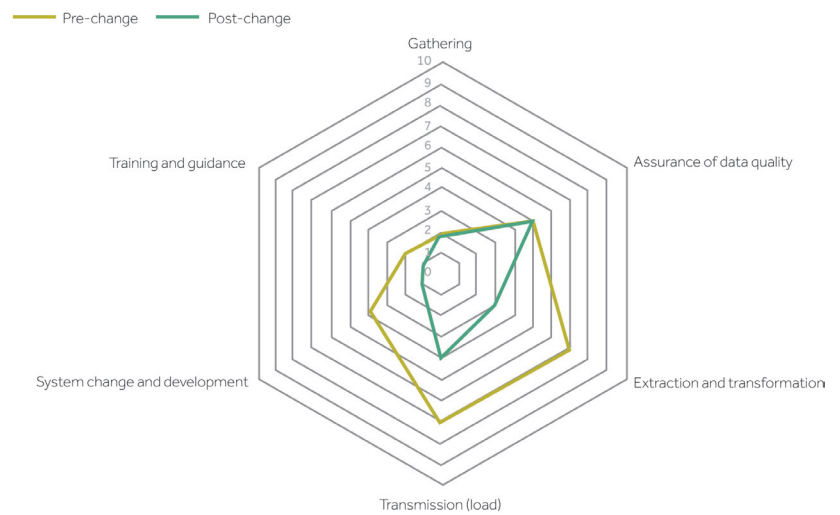
FINANCIAL RETURN - ANALYSIS OF CHANGE

The change does not eliminate the burden, and in some areas (gathering and quality assurance) no burden reduction is achieved. But in other areas, significant burden reductions have been realised. By evaluating change through the matrix, we are able to decide on the value of the change, while providers also have a clear indication of the impact on their local processes.