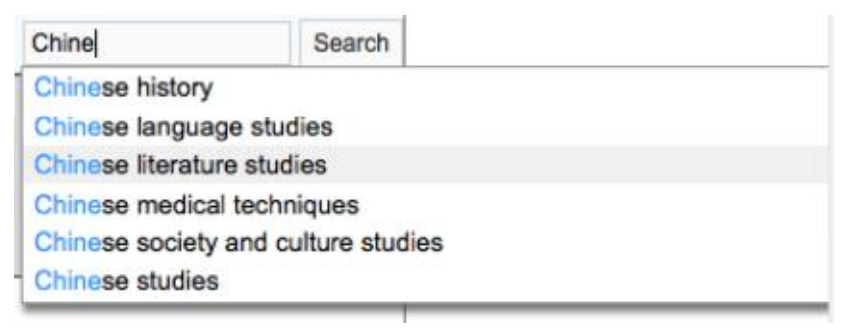
Figure 1 Type ahead function in Tematres

A crucial aspect in this regard is the way in which various systems will implement HECoS. Using modern user interface functions such as 'type ahead' or 'auto-suggest' to match likely term candidates with what a user has started to type improves usability considerably. We therefore recommend that system vendors integrate such a function in their applications and that lists of the HECoS terms be used in the comparable validation of cell values function in spreadsheets.